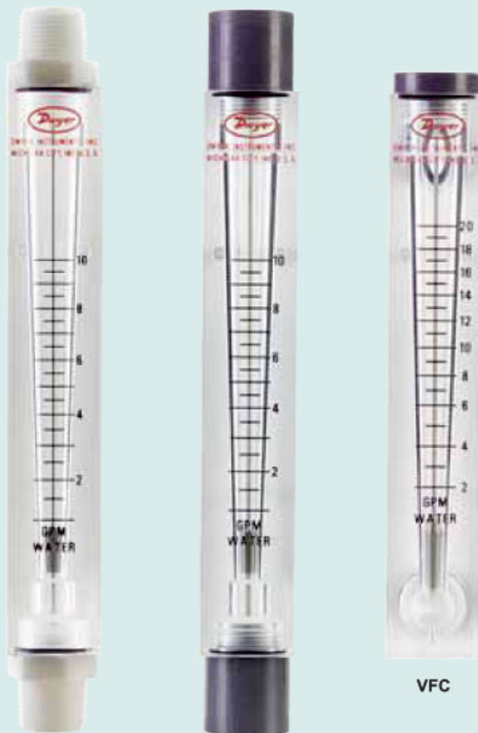
VFCII with End Connections