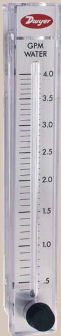
Model RMC-SSV 10" scale, 15-3/8" high

Polycarbonate, Gas Flow from 0.05-1800 SCFH, Water Flows to 10 GPM