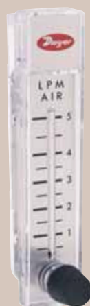
Model RMA-SSV 2" scale, 4-13/16" high