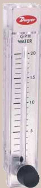
Model RMB-SSV 5" scale, 8-3/4" high