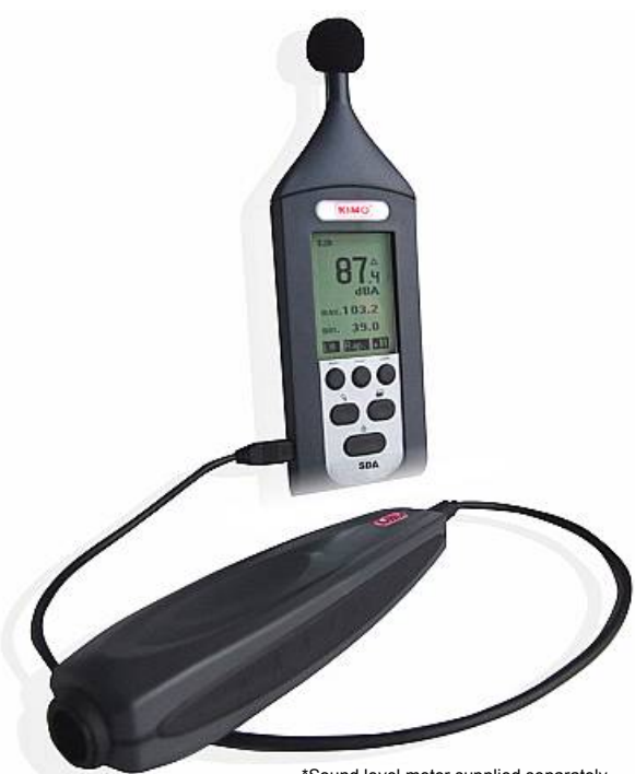
*Sound level meter supplied separately